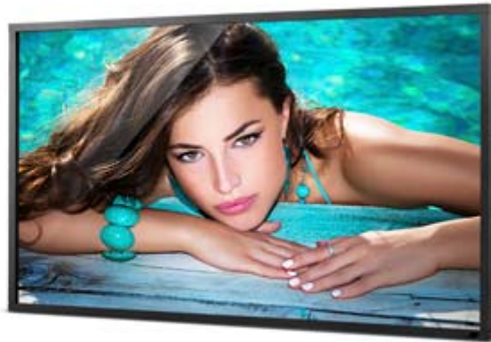
Full HD Resolution