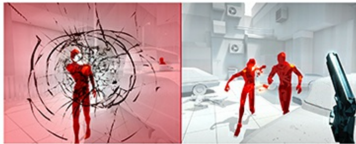
Low Input Lag OFF