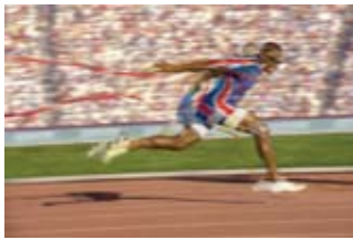
No Video Stabilization

The camcorder is equipped with Video Stabilization technology to ensure smooth recorded images. Stabilization precisely tracks even the slightest movements of the camcorder, then corrects the shaking to produce steady videos and crisp images.