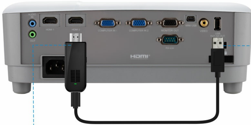
Wireless HDMI Dongle