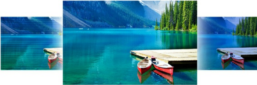
Blue light filter & Flicker Free