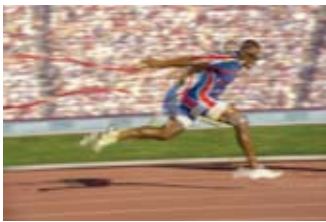
No Video Stabilization

The camcorder is equipped with Video Stabilization technology to ensure smooth recorded images. Stabilization precisely tracks even the slightest movements of the camcorder, then corrects the shaking to produce steady videos and crisp images.