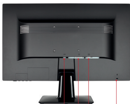
DC IN DVI D-Sub Kensington Security Lock