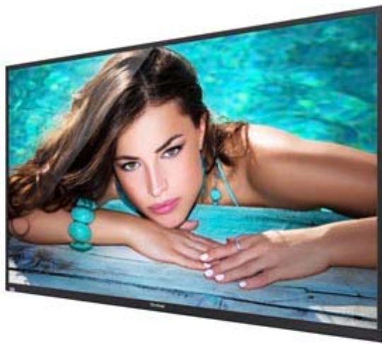
Full HD Resolution