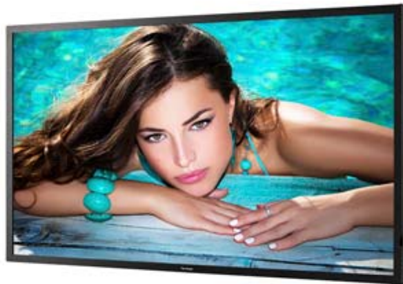
Full HD Resolution