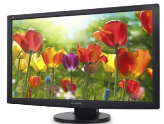
ViewSonic Flicker-Free Technology